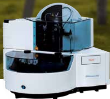
Thermo Scientific™ B·R·A·H·M·S™ KRYPTOR™ compact PLUS

Uncompromised quality for essential indications