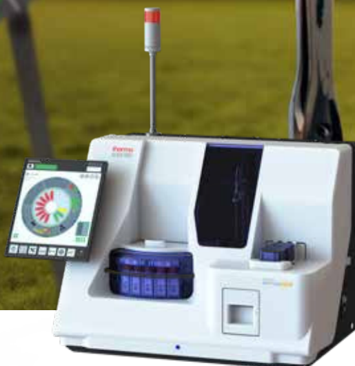
Thermo Scientific™ B·R·A·H·M·S™ KRYPTOR™ GOLD