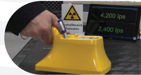
CoMo 170 DL with integrated dose rate measurement