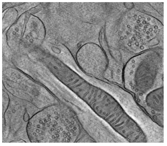
Figure 1. A slice through a 3D tomogram of a 200nm plastic section of brain tissue imaged by the Talos F200C G2 (S)TEM with Ceta 16M Camera. Sample courtesy of Benjamin H. Cooper from MPI Goettingen, Germany.

The SmartCam digital search-and-view camera simplifies interactive sample examination and allows daylight operation. Automatic software-controlled switching of apertures and of the cryo-box provides fast and easy operation of the microscope and facilitates remote operation for even more flexibility and convenience. Using the optional long duration dewar, unattended automated data collection sessions become possible for up to 96 hours. Liquid nitrogen must still be refiled in cryo-EM holders manually.