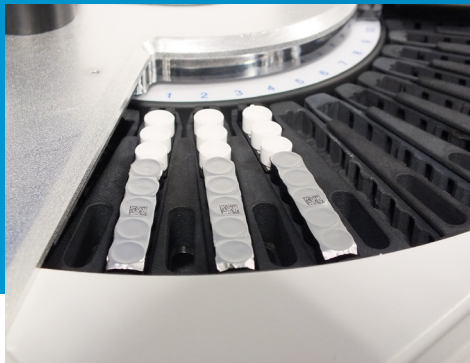
QR code ID of the strips